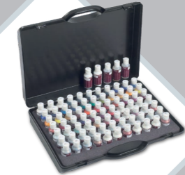
SCRATCH & SPOT REPAIR