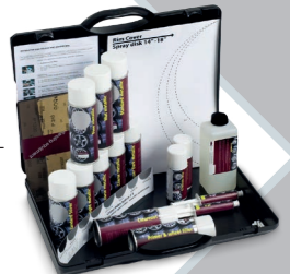
ALLOY WHEEL REPAIR