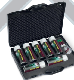
PLASTIC & FIBRE REPAIR