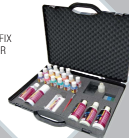
CHIP FIX REPAIR