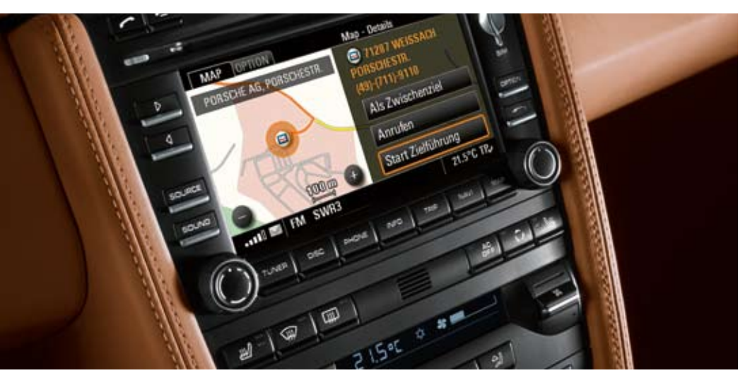
PCM including navigation system

Porsche Communication Management (PCM), the central information and communication system, is of the same high quality as your Porsche and it is just as suitable for everyday use. However, traces of wear or minor damage, such as a broken SIM card reader, can't