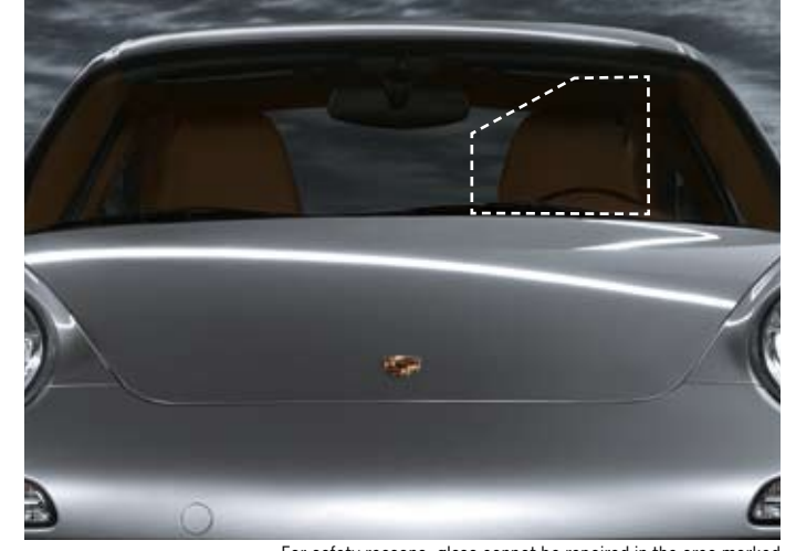
For safety reasons, glass cannot be repaired in the area marked