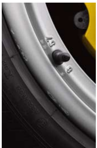
Alloy wheel with minor damage