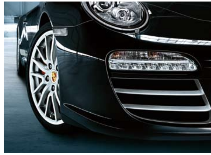
911 Carrera S

If you're involved in active sport, scratches and bruises are unavoidable. But 'wound healing' can be accelerated at Porsche.