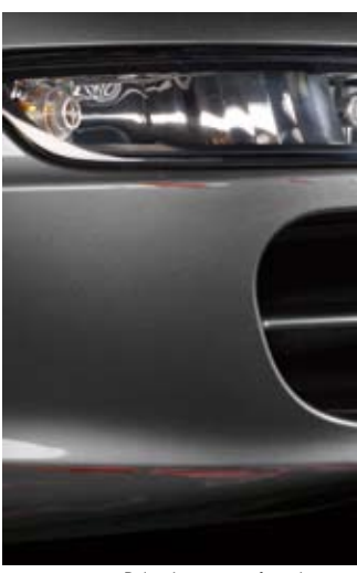
Paint damage on front bumper