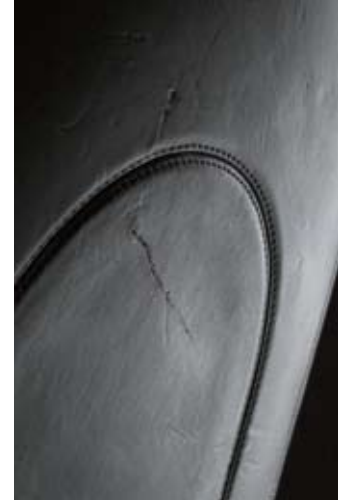
Damage to leather